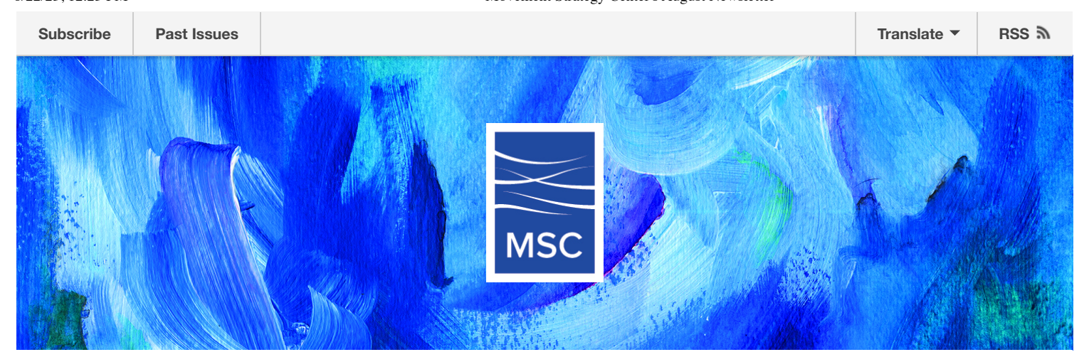
Movement Strategy Center's August 2023 Community News