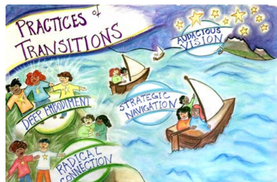
"Practices of Transitions" - mural by Kristen Zimmerman

How do we transition from a world of domination and extraction to a world of regeneration, resilience, and interdependence?