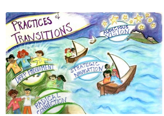
"Practices of Transitions" - mural by Kristen Zimmerman

How do we transition from a world of domination and extraction to a world of regeneration, resilience, and interdependence?